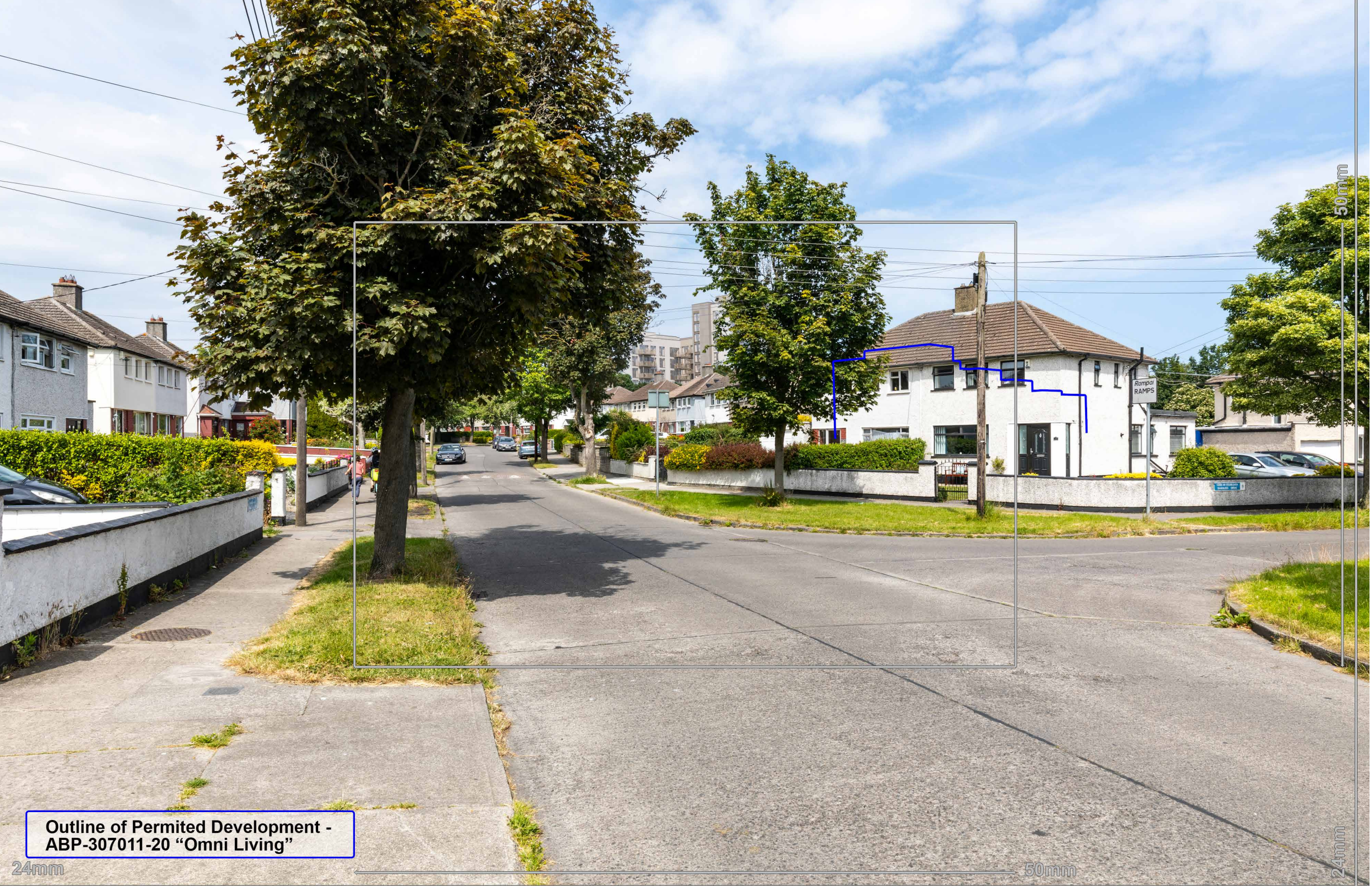
Outline of Permitted Development - ABP-307011-20 “Omni Living”